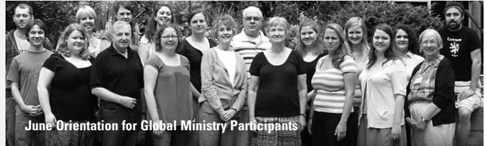
June Orientation for Global Ministry Participants